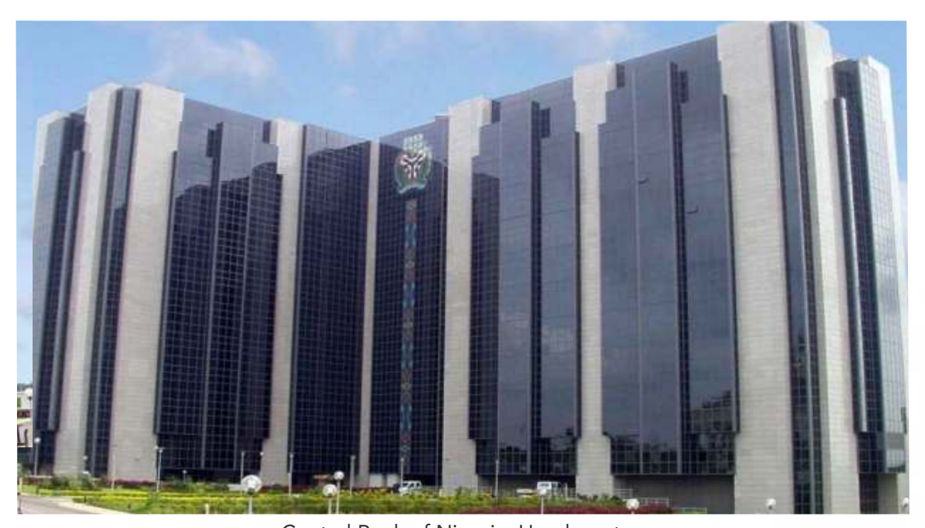
Central Bank of Nigeria, Headquarters

The rebate scheme which is part of the CBN RT200 policy was designed to serve as an incentive for exporters in the non-oil sector to encourage repatriation and sale of export proceeds into the FX market focused only on processed and value-added products.