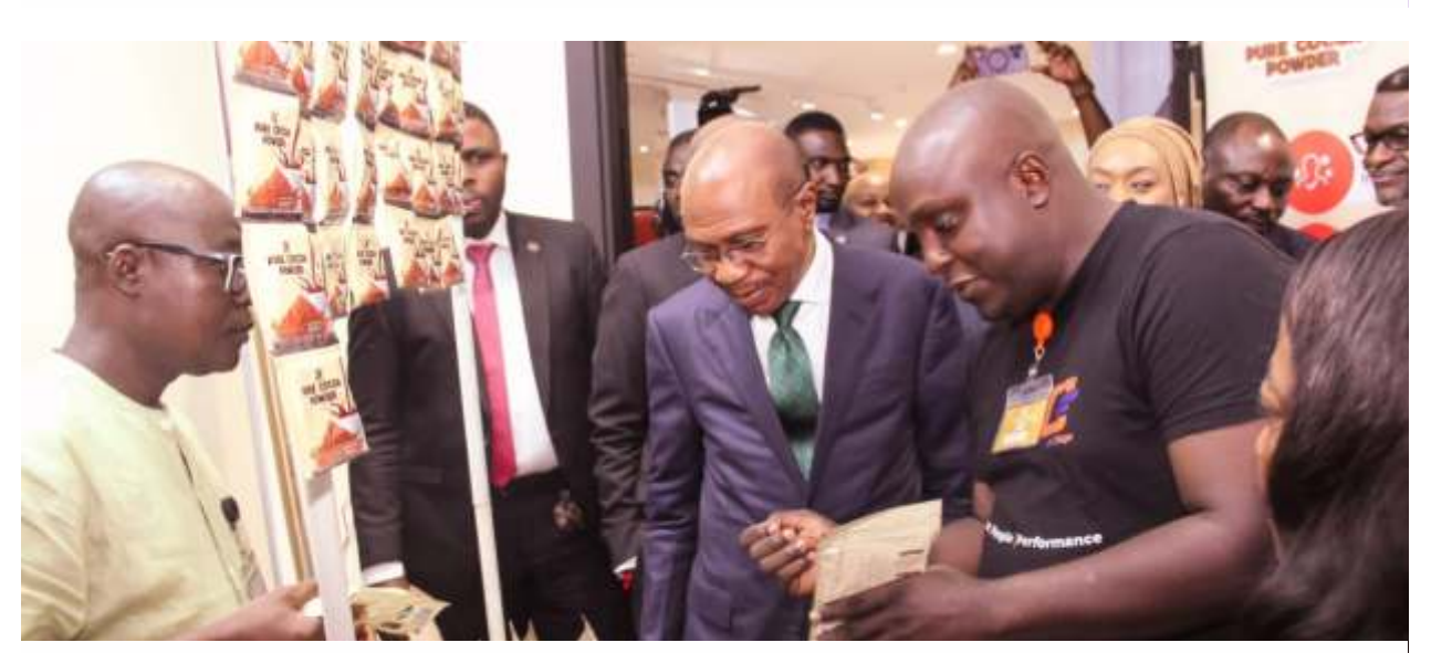
CBN Governor, Mr. Godwin Emefiele being shown locally made and processed products at the 3rd edition of the RT200 Non-Oil Export Summit