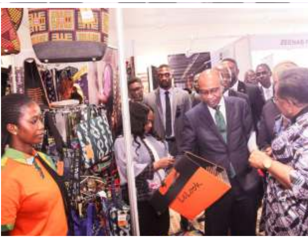
CBN Governor, Mr. Godwin Emefiele assessing locally made and processed products at the 3rd edition of the RT200 Non-Oil Export Summit